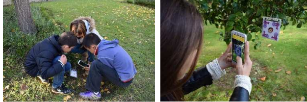
Fig. 3. Students exploring the EduPARK game in an outdoor environment.

BE, registrations for one class from both cycles were open under the Open Week. During the registration period, two teachers, hence two classes from the 1 st Cycle, showed strong interest in participating. As a result, this experience was held with two classes of the 1 st Cycle and one class of the 3 rd Cycle of BE (Fig. 3), from two neighbouring schools of the city park.